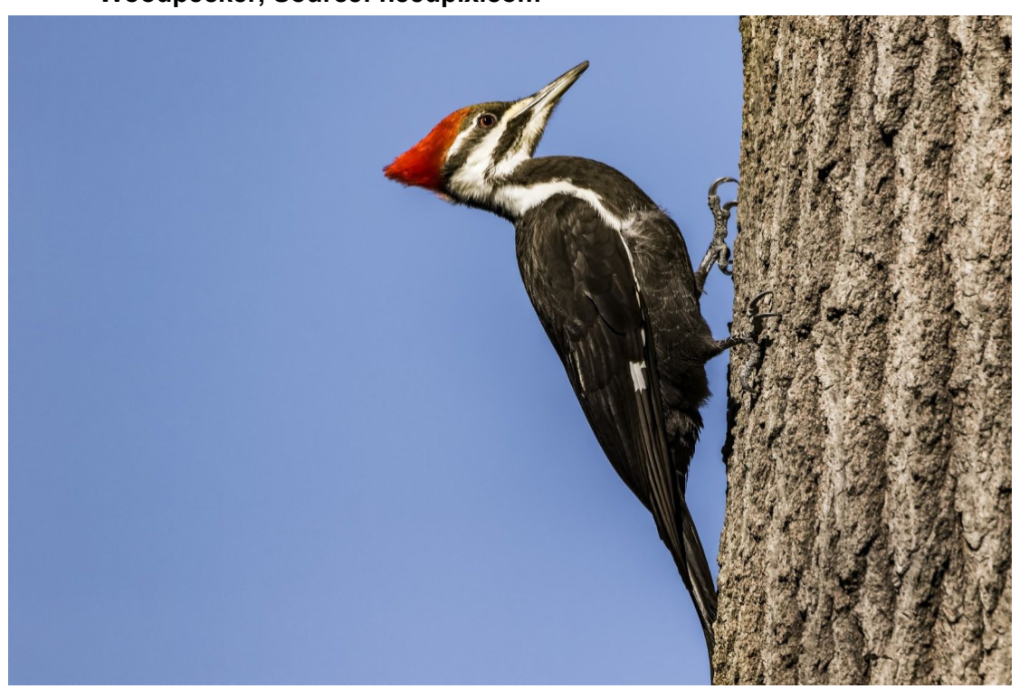
Woodpecker, Source: needpix.com