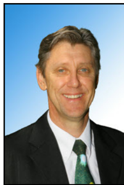
Gary Bates image courtesy AlienIntrusion.com

Essays must be sent, by email or in paper form, by April 30. More information is on our web site!